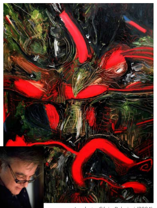
La chute, Silvio Palmieri (2004)

Co-produced by the Ensemble contemporain de Montréal (ECM+), the Ensemble Paramirabo and the SMCO's MNM Festival.